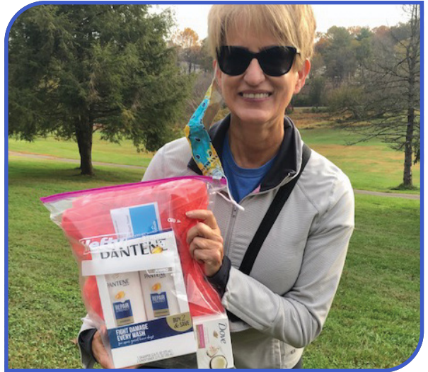
Volunteer with Women's Blessing Bag

https://www.samaritanpurse.org/operation-christmas-child/volunteer-at-a-shoebox-processing-center