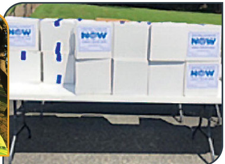
Nourish Now Donations